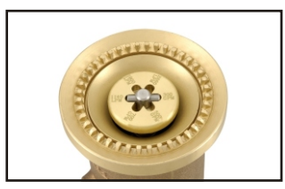
Spring-loaded baffle for easy change of flows